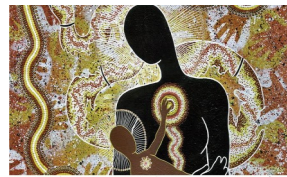
Because of Her, We can! National Aboriginal and Torres Strait Islander Sunday 1 July 2018

It is time for us to celebrate and embrace the role that women have played. They have fought for justice, reconciliation and social change. Our Mother Mary also opened her heart to the Lord and is another female inspiration.